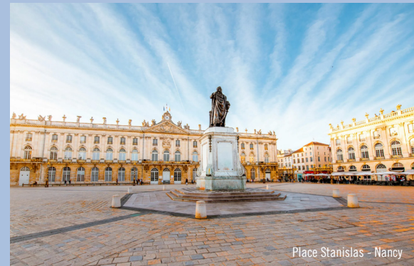
Place Stanislas - Nancy

The main goal of these sessions is to prototype a physical game for people with disabilities. Working in teams, you will create a game playable inside a museum. The game created will be a kind of escape game where the players solve puzzles and mechanics while going back and forth from one piece of art to another. Each session will be about how to materialise a concept you have in mind, from the idea to the physical object in your hand.