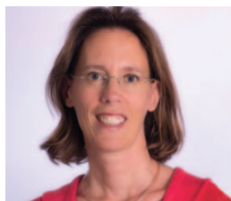
C. Kwapil