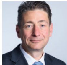
N. Forgó

Requirements: Regular attendance and active participation in class discussions (40%) and an open-book essay exam (60%).