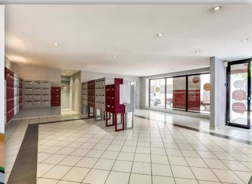
Entrance Résidence Nexity Riquier