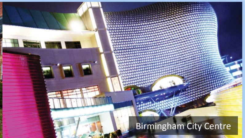
Birmingham City Centre