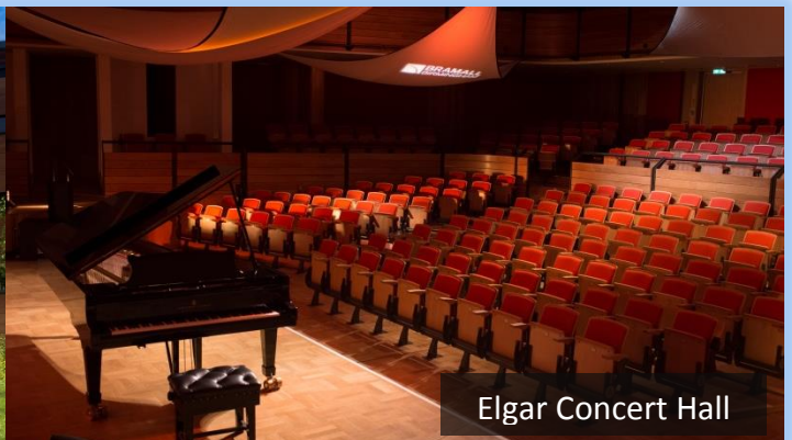
Elgar Concert Hall