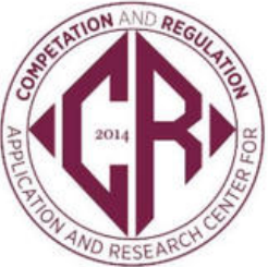
Application And Research Center For Competition And Regulation