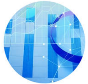
Centre Of Experimental Economics