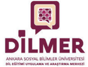
Language Teaching Res. And App. Centre