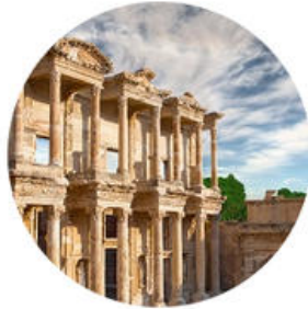
Center For Culture And Civilization Researches