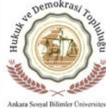
ASBÜ Hukuk ve Demokrasi Gençlik Öğrenci Topluluğu