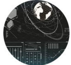
Application And Research Centre For Method Education