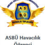
ASBÜ Havacılık Öğrenci Topluluğu