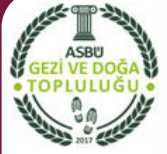
ASBÜ Gezi ve Doğa Öğrenci Topluluğu