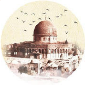
Research Centre For Quds Studies