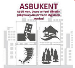
Asbü Kent, Çevre Ve Yerel Yönetim Çalışmaları Araştırma Ve Uygulama Merkezi

For further details about research centers, you can click here .