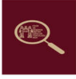
ASBÜ Fikir ve Düşünce Üreten Gençler Öğrenci Topluluğu