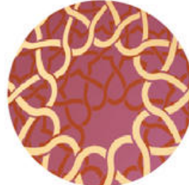
International Center For Islamic Economics And Finance