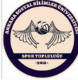
ASBÜ Spor Öğrenci Topluluğu