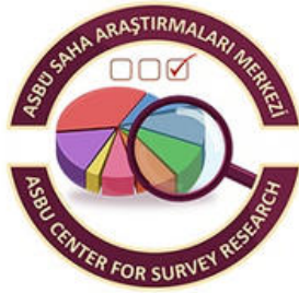
Center For Survey Research