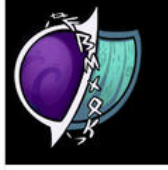
ASBÜ Kurgu Evrenler Öğrenci Topluluğu