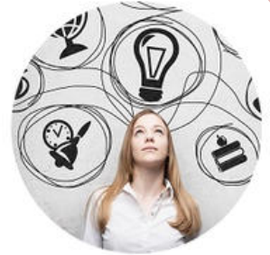
Center For Higher Education Research